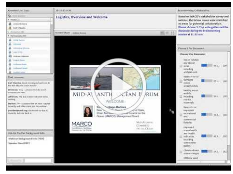
2020 Mid Atlantic Ocean Forum