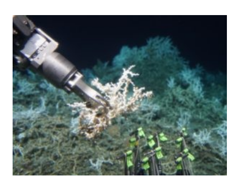
Alvin collects a sample of Lophelia pertusa

MARCO's June 24 "Climate Change and the Impacts to Deep-Sea Corals" webinar recording is now available to view. Learn about air-sea interactions and how climate changes are affecting deep-sea corals and how habitat suitability models can help predict the survival of certain coral species.