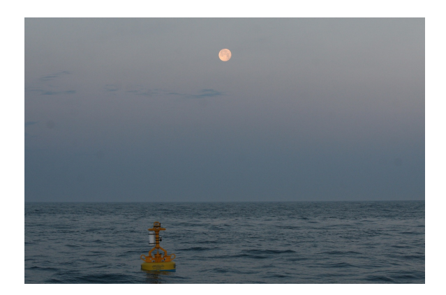
Whale monitoring buoy

In June, the Maryland Department of Natural Resources (DNR), Maryland Energy Administration (MEA), University of Maryland Center for Environmental Science (UMCES), and Woods Hole Oceanographic Institution launched an ocean buoy that monitors and provides daily reports of whales detected off Maryland's Atlantic coast. This technology continues efforts to collect environmental data for offshore wind. Learn more at: <a href="https://news.maryland.gov/dnr/2021/07/06/monitoring-buoy-to-help-research-marine-mammals-off-atlantic-coast/">https://news.maryland.gov/dnr/2021/07/06/monitoring-buoy-to-help-research-marine-mammals-off-atlantic-coast/</a>