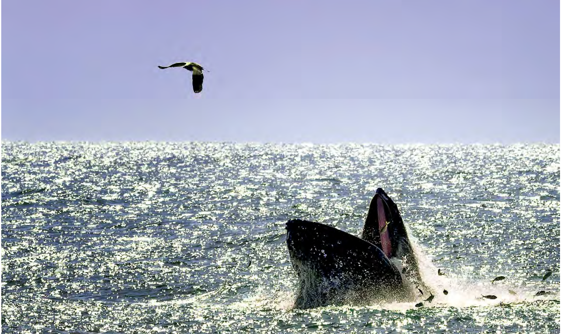
Humpback whale outside Long Beach, New York.